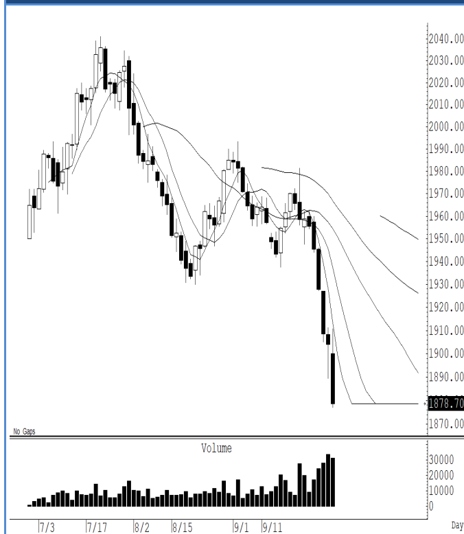
GOZ23 (Close 1,878.70 Chg -25.40)

ราคาทองคำโลกปรับตัวลงต่อเนื่อง เราแนะนำยกการ์ดสูงหรือตั้ง stop ไว้ เนื่องจากทิศทางเป็นขาลง แนะนำ trading ในกรอบ 1,895-1,860 ดอลลาร์ รับรู้กำไร แต่ถ้าในกรณีที่ปิดต่ำกว่าระดับ 1,859 ดอลลาร์ แนะนำ ถือ short หวังผลปรับตัวลงไปแถว ๆ 1,815 ดอลลาร์ รับรู้กำไร